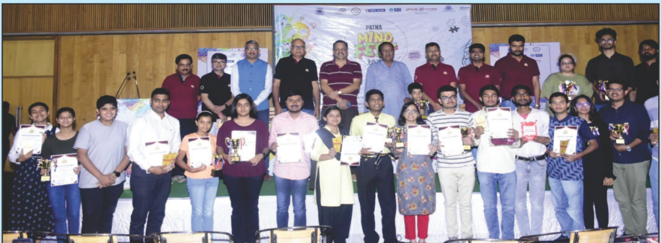
Organisers with Participants displaying their Awards